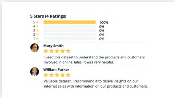
Figure 1: Easily collaborate with data leveraging crowdsourcing capabilities