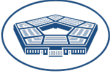
U.S. Department of Defense