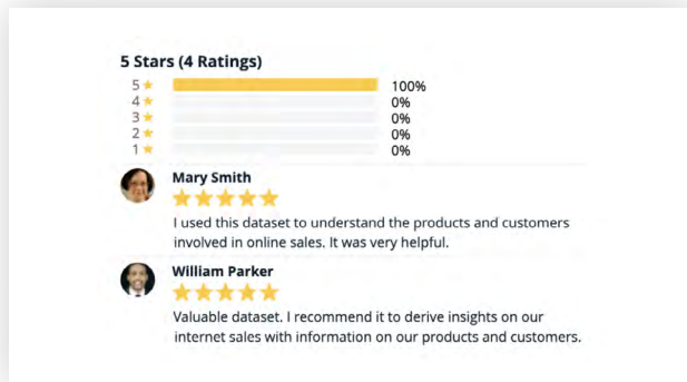
Figure 1: Easily collaborate with data leveraging crowdsourcing capabilities